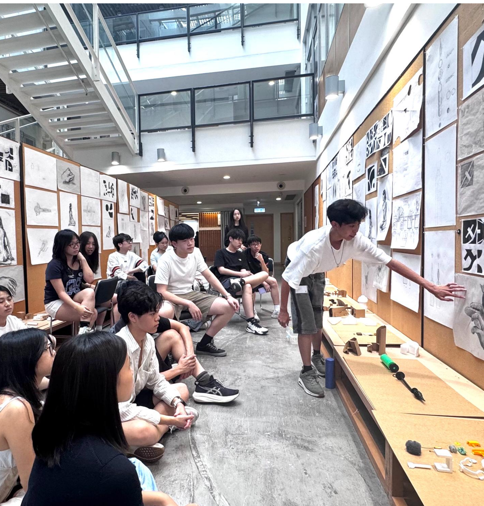
AEP Student Presentation and Project Review