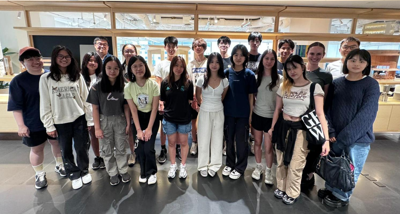
AEP Office Visits: Ronald Lu & Partners (Above), Foster & Partners (Below)