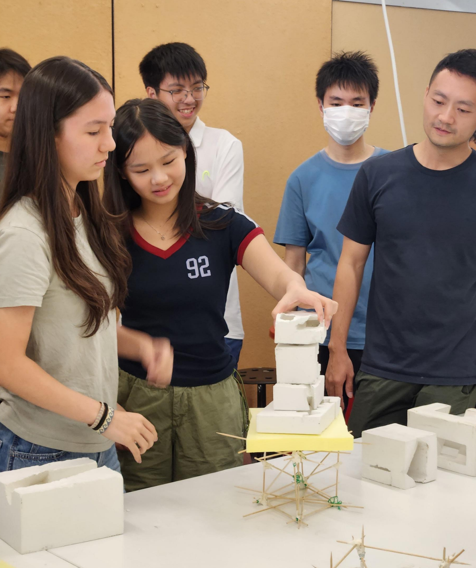
AEP Structural Challenge