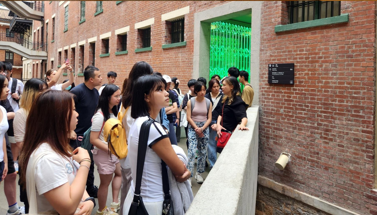
AEP Guided Building Tour at Tai Kwun