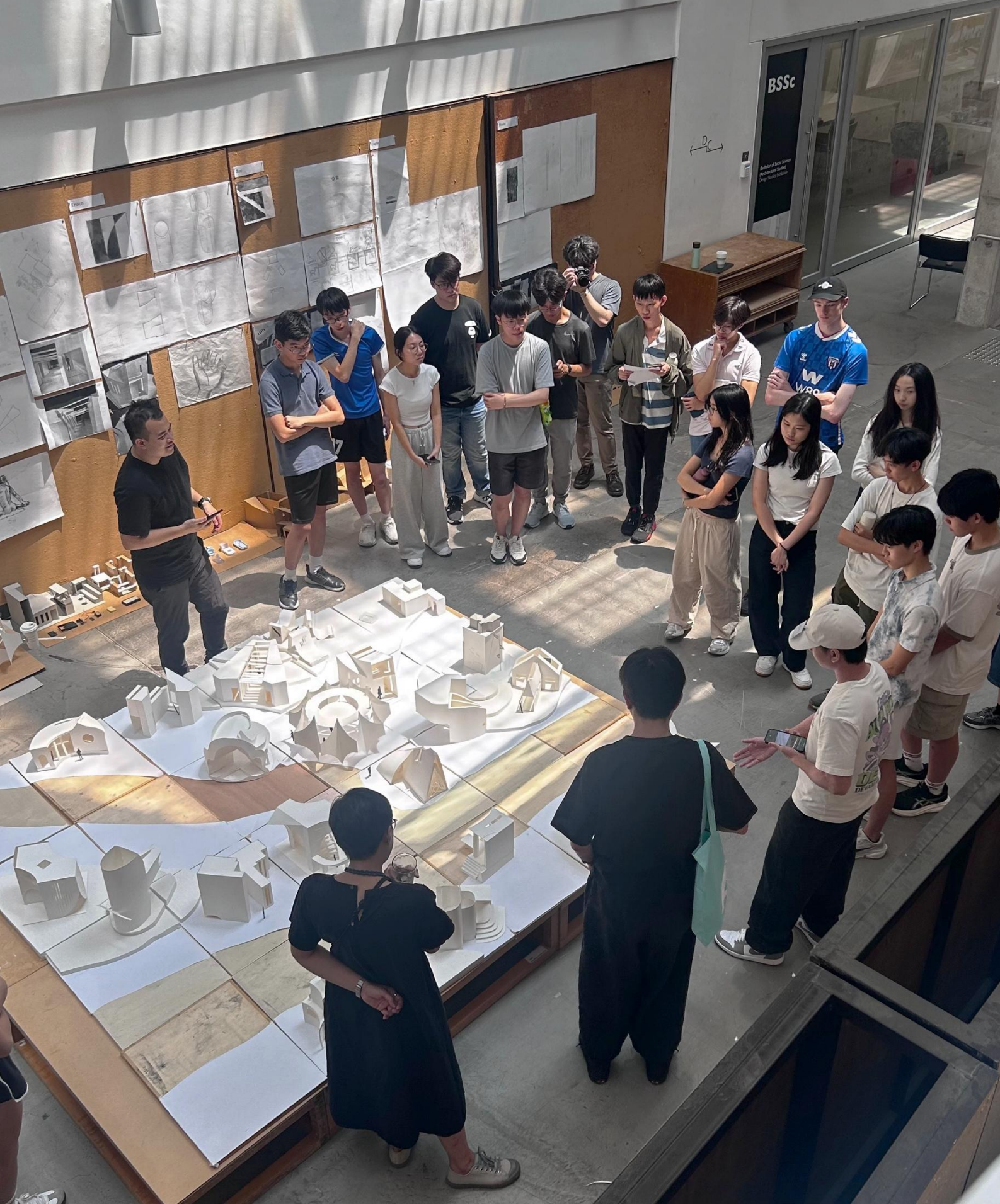
AEP 2025 Exhibition: Architecture Explorer Programme, School of Architecture CUHK