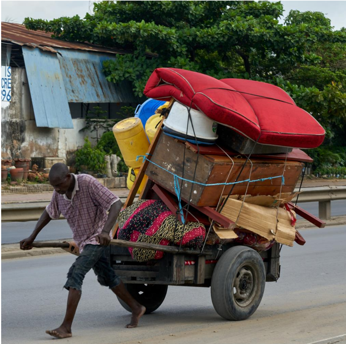
Home location at Mombasa, Kenya