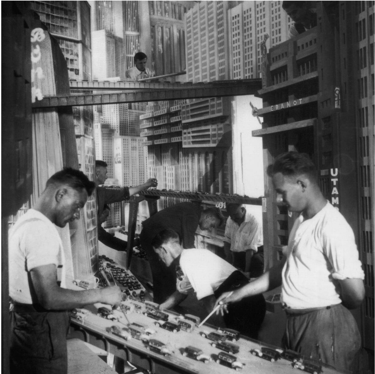
The Making of Metropolis (1927)