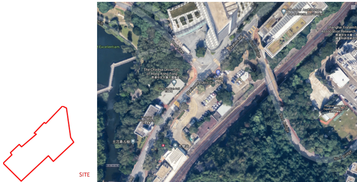
Figure 1: site location

The architects are requested to propose the exact location of the building within the site, while considering the preferred orientation of the building, accessibility for pedestrians, visibility from surrounding sites and buildings and the noise pollution from the MTR line.